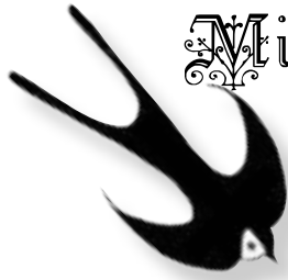
Table of Contents Literacy Exercises