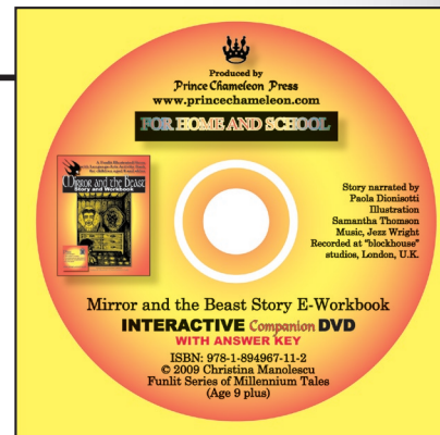
MIRROR AND THE BEAST STORY E-WORKBOOK, Interactive, DVD format ISBN: 978-1-894967-11-2