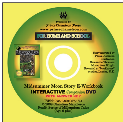
MIDSUMMER MOON STORY E-WORKBOOK, Interactive, DVD format ISBN: 978-1-894967-18-1